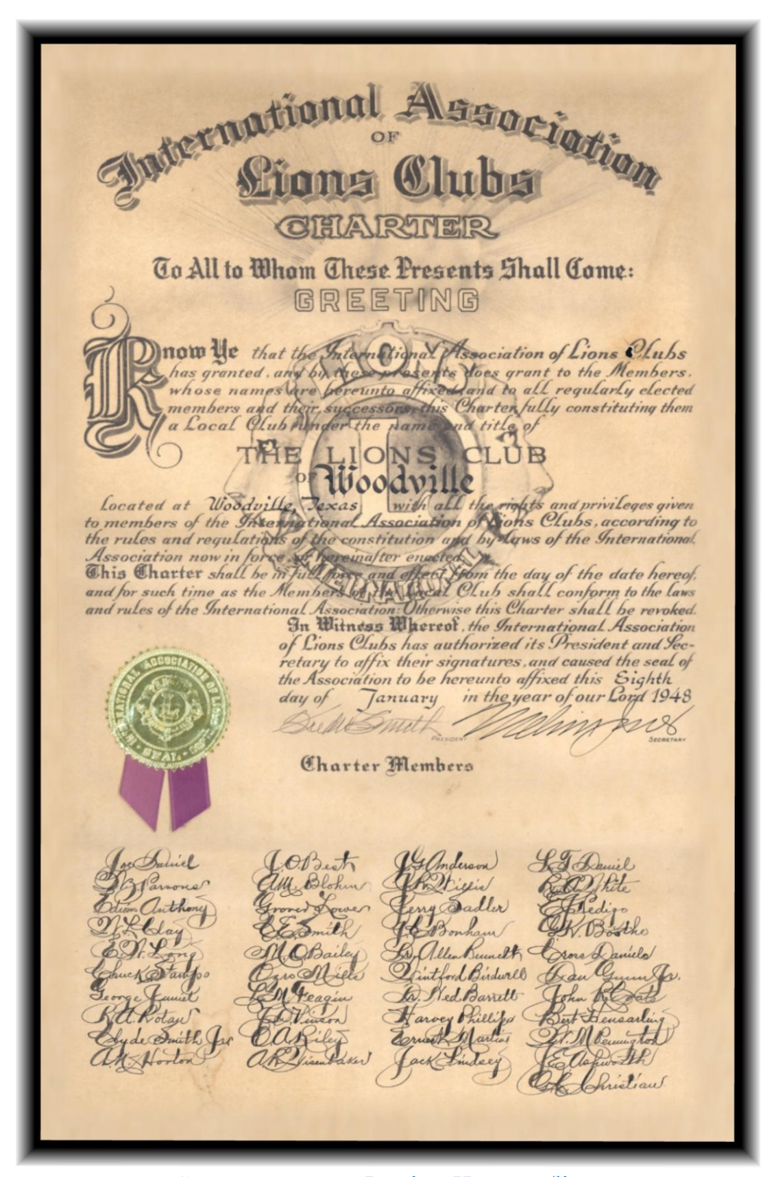
See more at www.PreciousHeart.net/lions