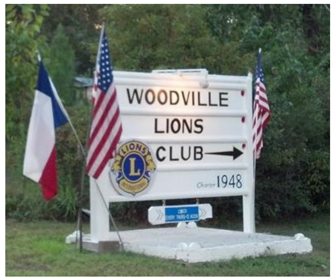
Thursdays @ Noon, except 2nd Thursday 6:30 pm Hwy 190 East of Courthouse, on Left, about 1.5 miles