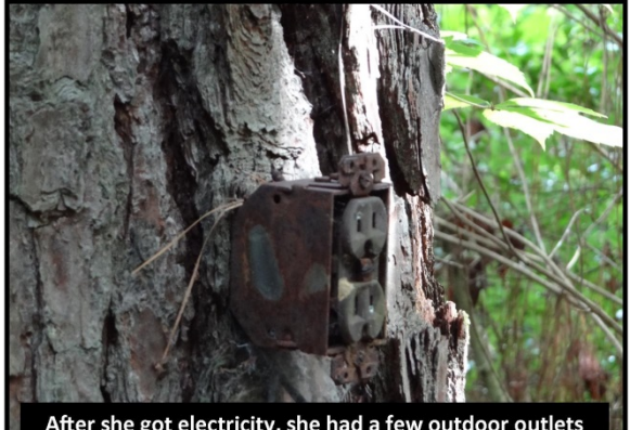
After she got electricity, she had a few outdoor outlets