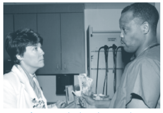
"Professional chaplains play an important role in helping staff members cope with personal problems."