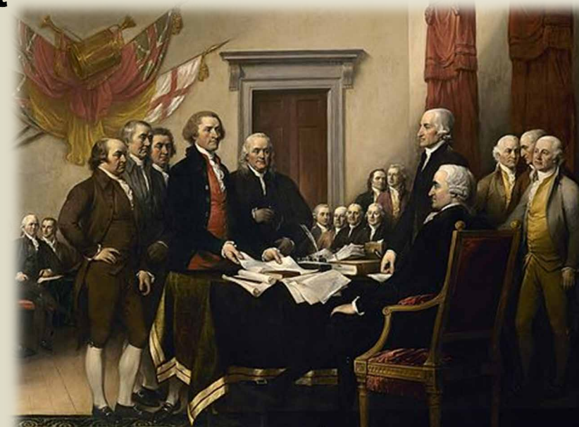
Declaration of Independence, by John Trumbull