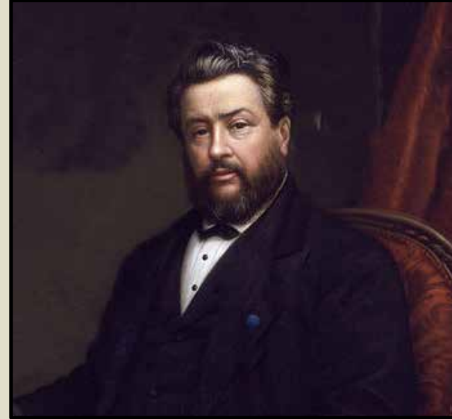
Charles H. Spurgeon, 1885 by Alexander Melville

and this gives place to morning light in which our eyes are unto the Lord.