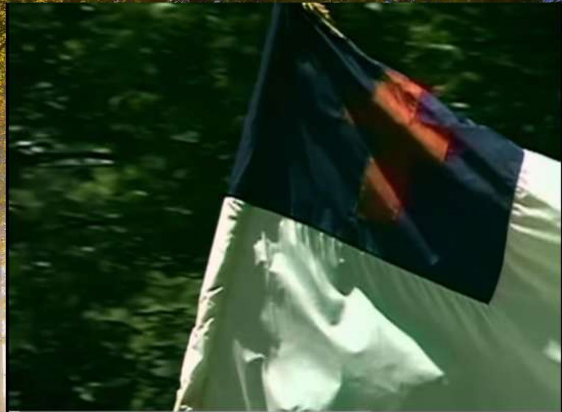
Cedarmont Kids - Onward Christian Soldiers

Christ, the royal Master, leads against the foe