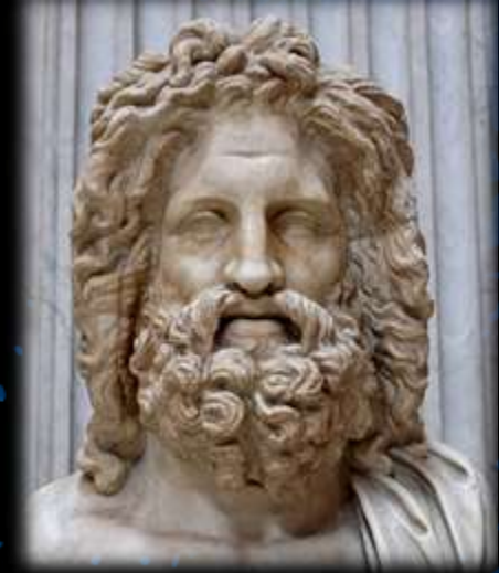
Zeus, ancient Roman bust found in Otricoli in 1775