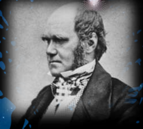
Charles Darwin, c. 1854 author of On the Origin of Species , 1859