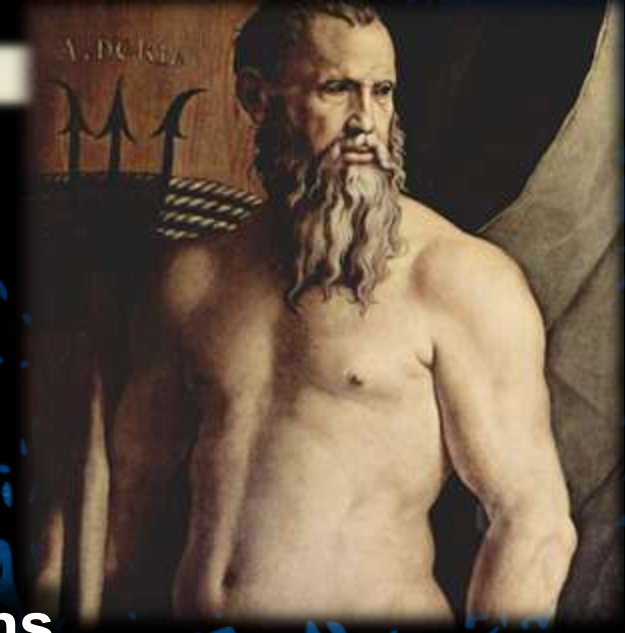
Andrea Doria as Neptune, c. 1540, by Angelo Bronzino

Seeing beautiful Andromeda tormented that roused the anger of Poseidon Poseidon to the Greeks – Neptune to Romans Poseidon, god of seas – brother of Zeus Sent a serpent to ravage the coasts of the Aethiopians Punishment for hurting beautiful Andromeda Perseus, Hero god, fresh from killing Medusa ... Perseus rescues Andromeda ... MARRIES her Despite the fact she was already married to her uncle! Greeks & every tribe READ the sky