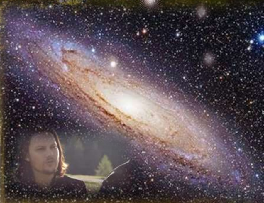
Andromeda Galaxy, closest galaxy to Milky Way, 2.5 million light-years from earth estimated over 1,000,000,000,000,000 stars