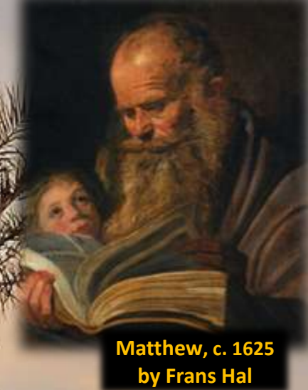
Matthew, c. 1625 by Frans Hal