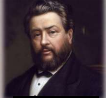
Charles H. Spurgeon by Alexander Melville (1834-1892)

Bezalel – Exodus 31, 36 & 39 – chief architect of the Tabernacle & builder of the Ark of the Covenant