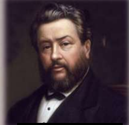
Charles H. Spurgeon (1834-1892)

These 7 Simple-Sounding Blessings – ALL LOVE Yet EACH one's meaning is both earthy also reaching Heaven in Excellence