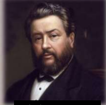
Charles H. Spurgeon by Alexander Melville (1834-1892)

The learned have collected 288 different opinions of the ancients with regard to happiness, and there is NOT ONE which hits the mark but our Lord has, in a few telling sentences, told us all about it without using a solitary redundant word, or allowing the slightest omission.