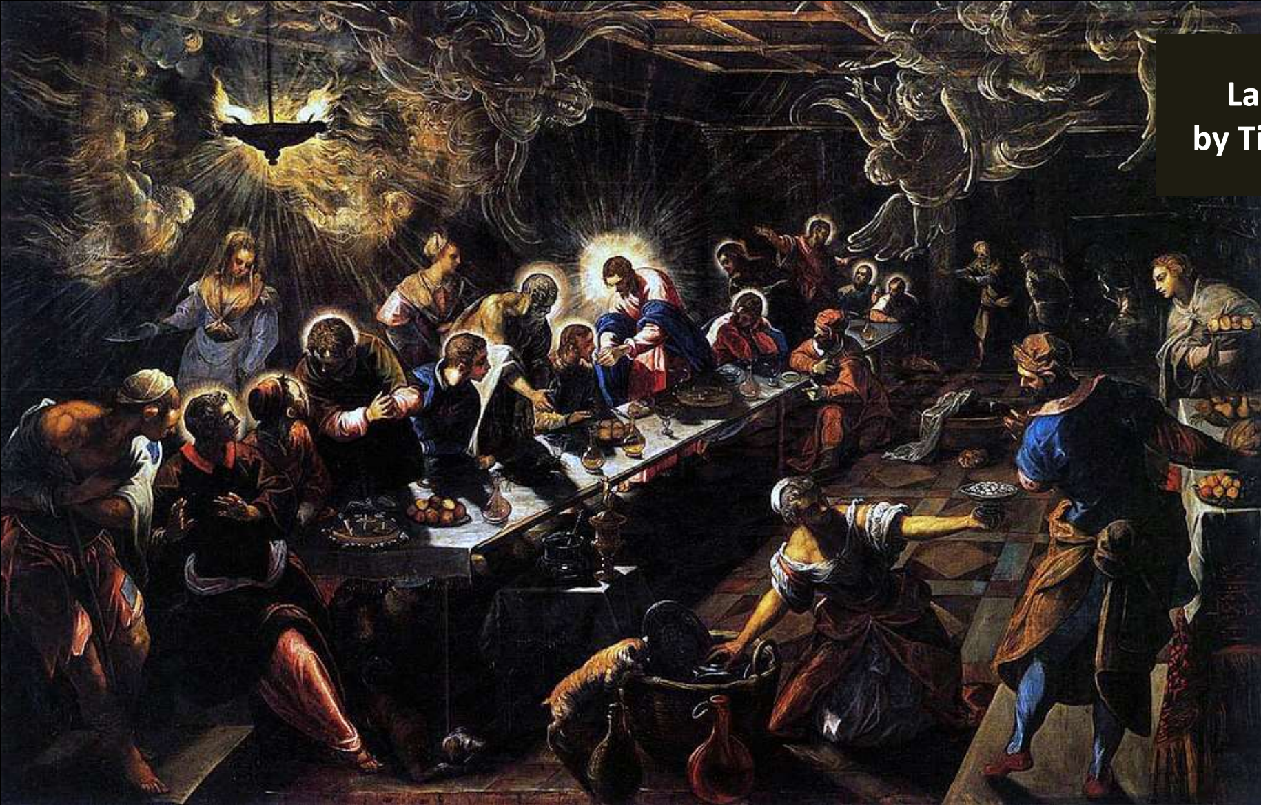
Last Supper, 1592–94 by Tintoretto (1548-1549)