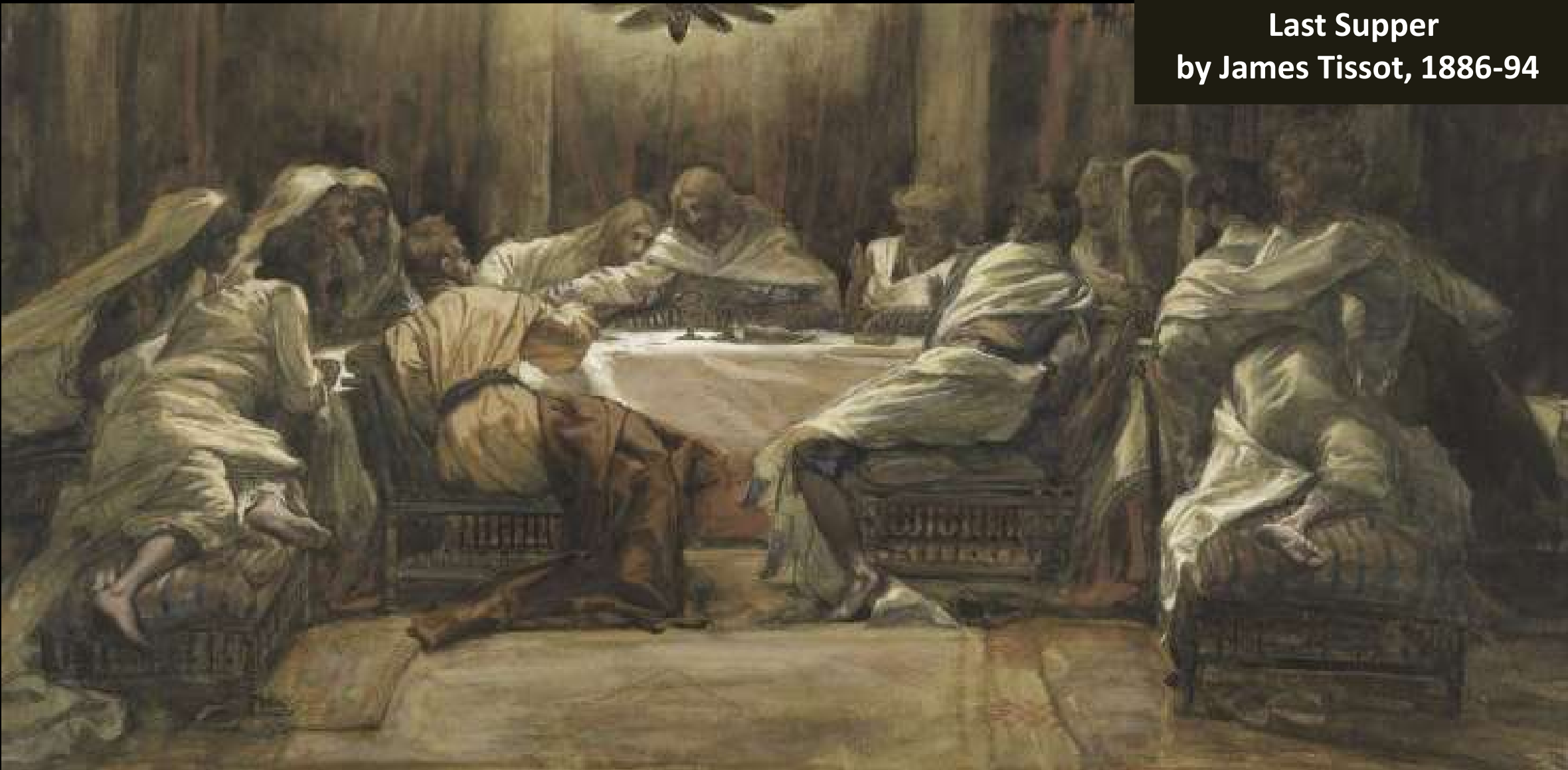
Last Supper by James Tissot, 1886-94