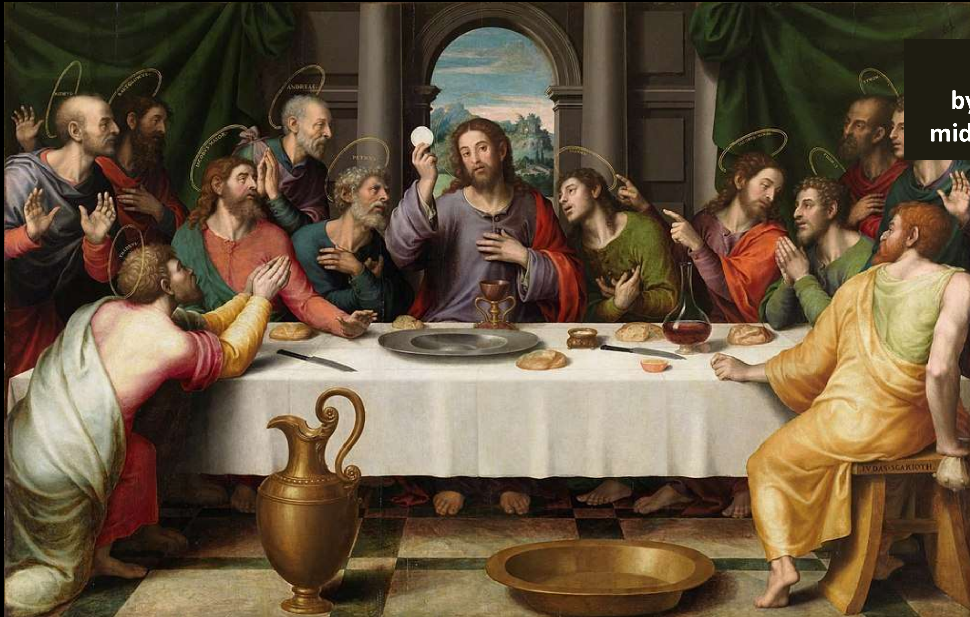
First Eucharist by Juan de Juanes mid-late 16th century