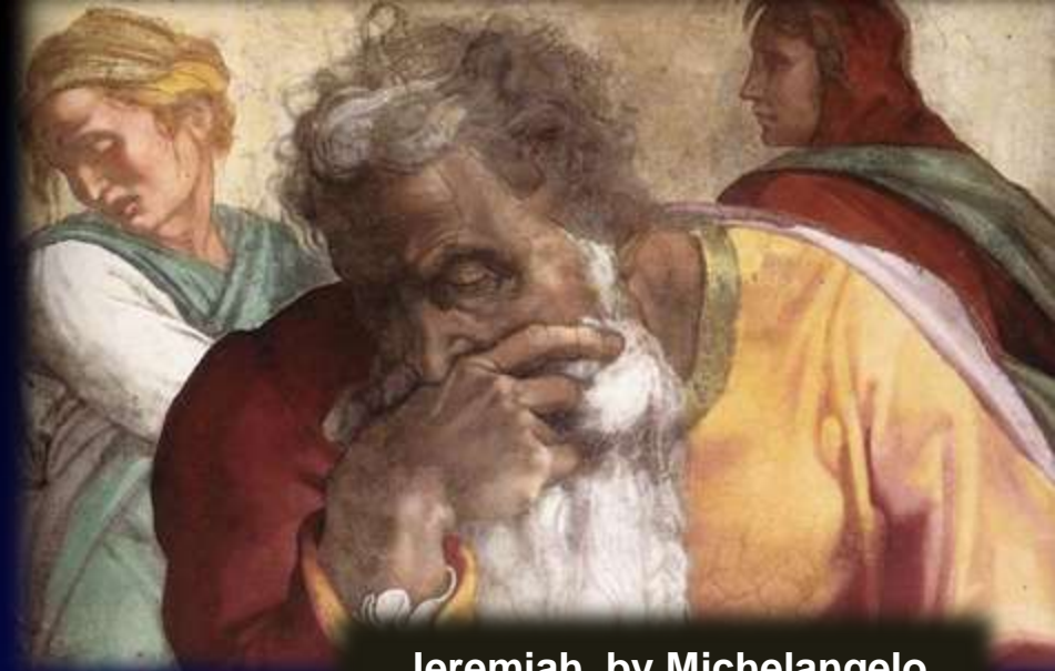
Jeremiah, by Michelangelo Ceiling of Sistine Chapel, Rome

11 so is my WORD that goes out from my mouth: It will not return to me EMPTY , but will accomplish what I DESIRE & achieve the PURPOSE for which I sent it.