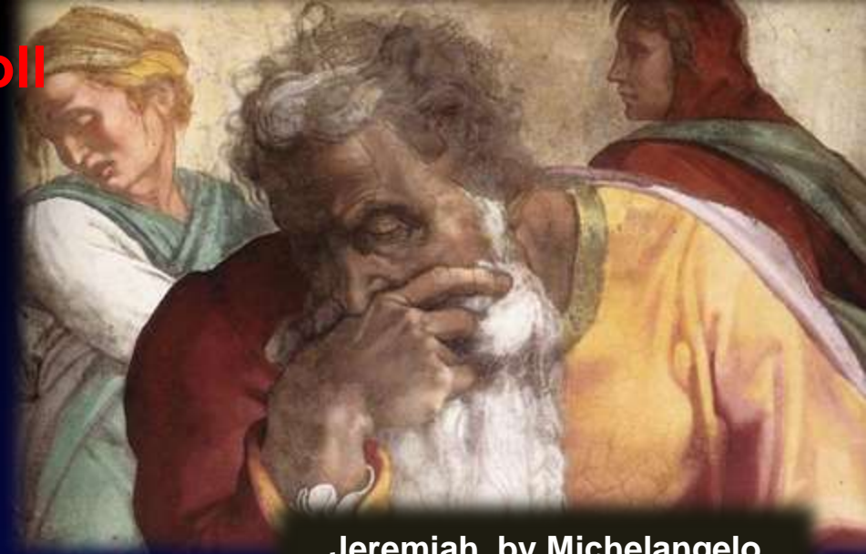
Jeremiah, by Michelangelo Ceiling of Sistine Chapel, Rome