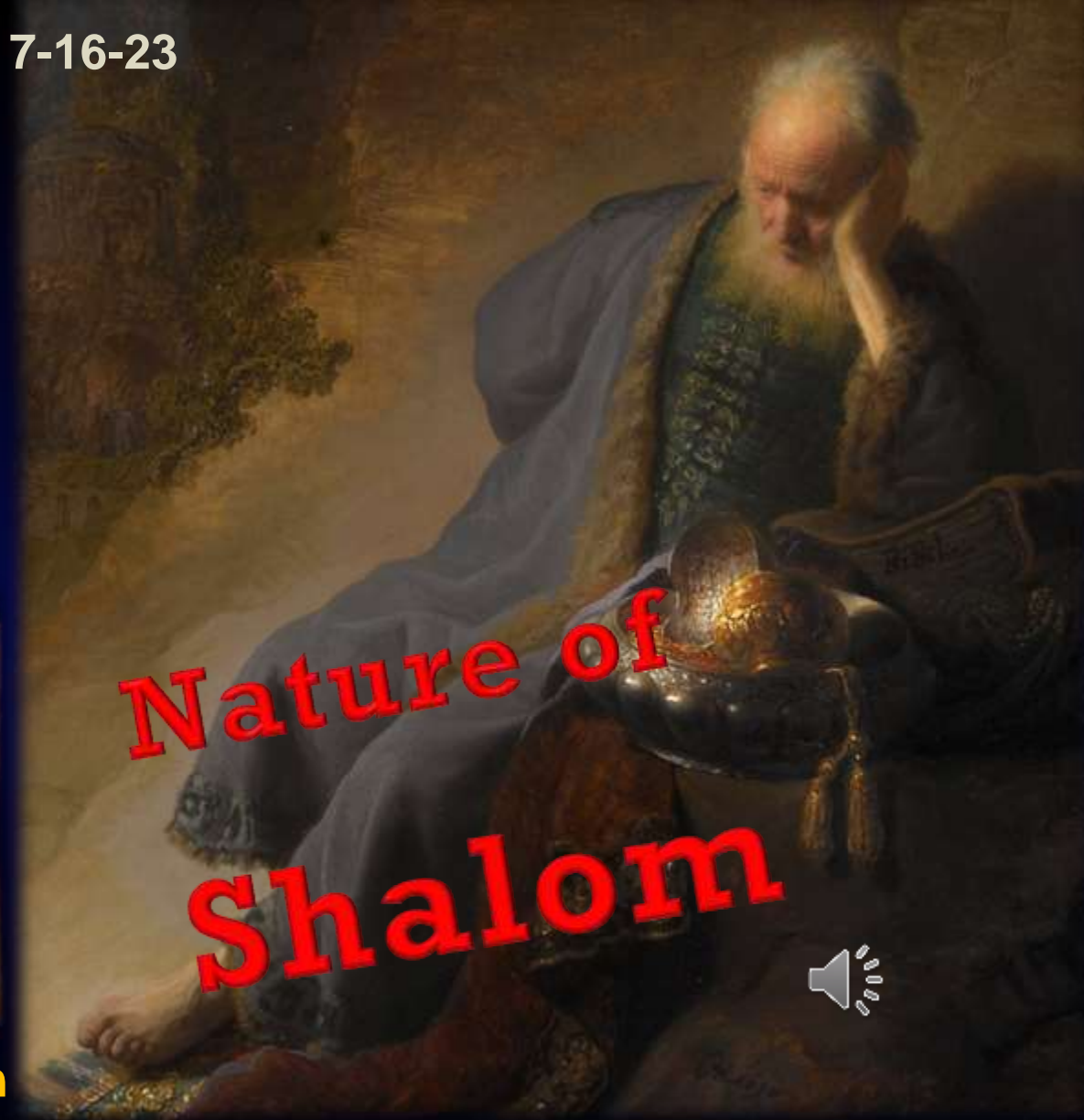
Jeremiah Lamenting the Destruction of Jerusalem, c. 1630, by Rembrandt

Pray to the Lord for it, because if it Shalom , you too will Shalom ."