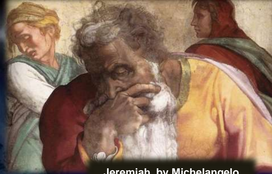
Jeremiah, by Michelangelo Ceiling of Sistine Chapel, Rome

GOD thru Jeremiah shares HEART of Gold God's Heart of Gold