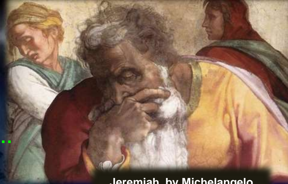
Jeremiah, by Michelangelo Ceiling of Sistine Chapel, Rome