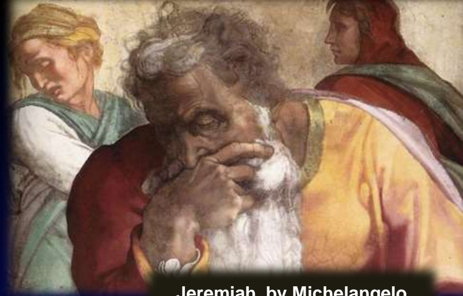
Jeremiah, by Michelangelo Ceiling of Sistine Chapel, Rome