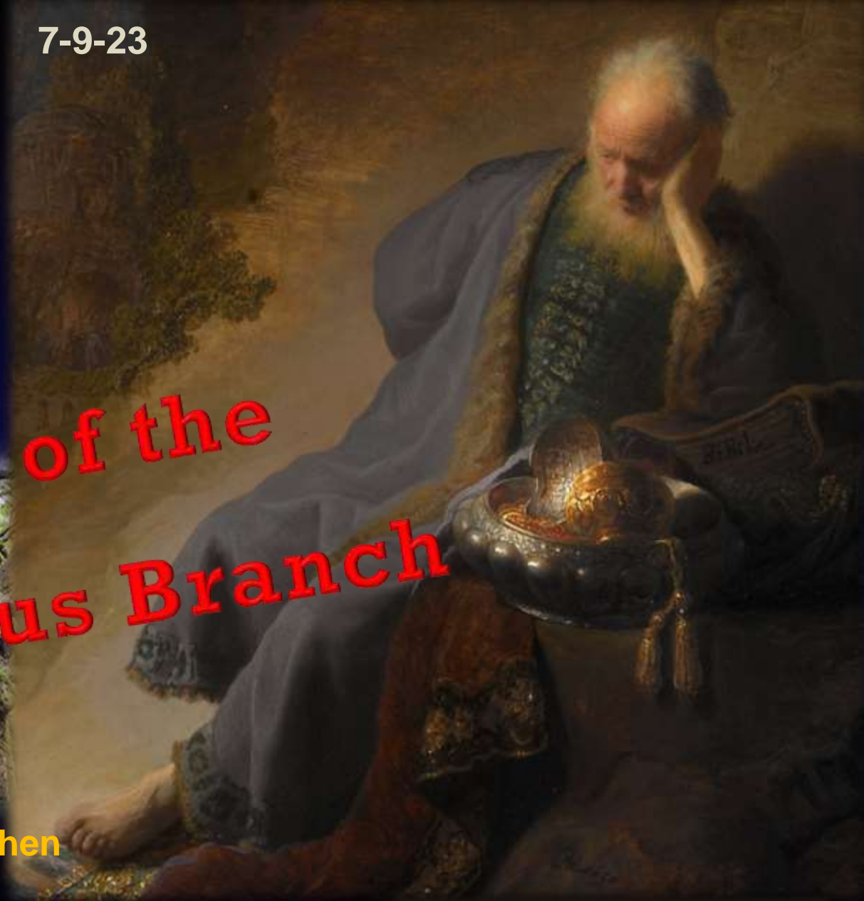
Jeremiah Lamenting the Destruction of Jerusalem, c. 1630, by Rembrandt

23:5 “Days are coming,” declares the Lord, “when I will raise up for David a Righteous Branch, a King who will Reign Wisely and do what is Just