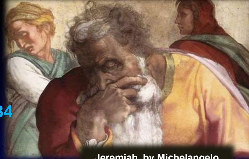
Jeremiah, by Michelangelo Ceiling of Sistine Chapel, Rome

whereon God reigned in the midst of his people.