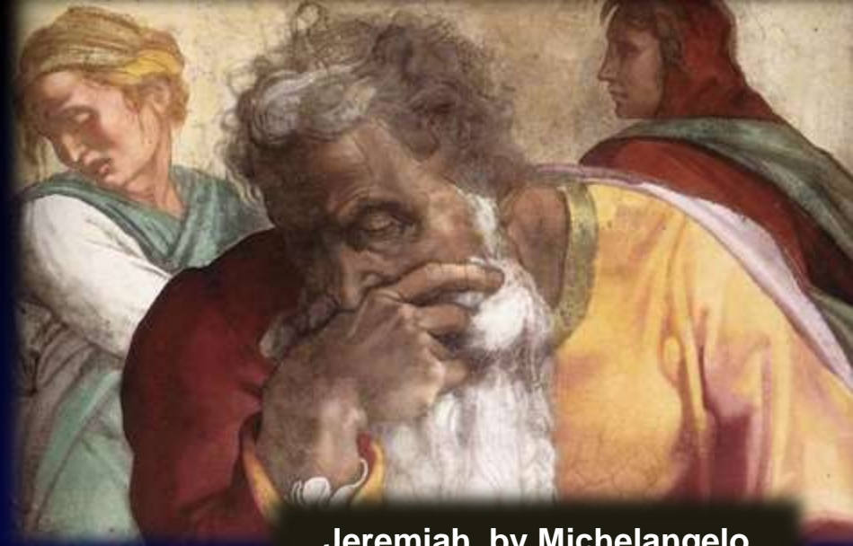
Jeremiah, by Michelangelo Ceiling of Sistine Chapel, Rome