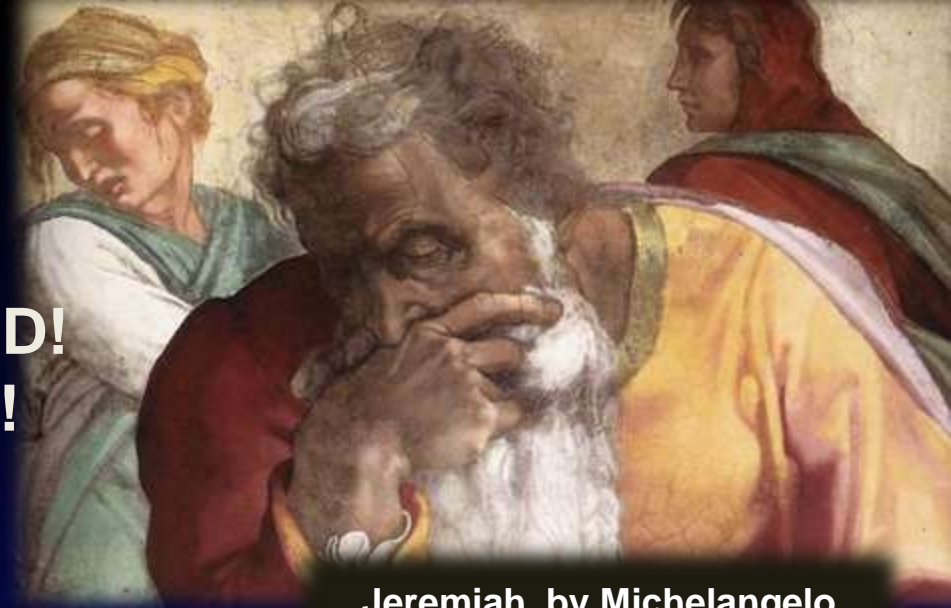
Jeremiah, by Michelangelo Ceiling of Sistine Chapel, Rome