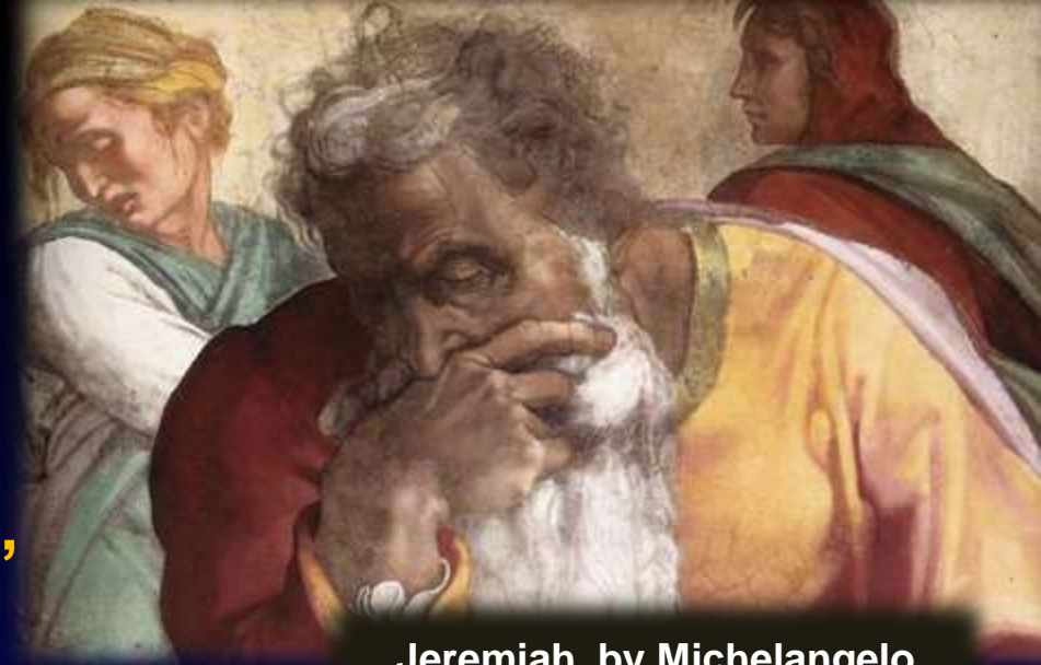
Jeremiah, by Michelangelo Ceiling of Sistine Chapel, Rome

Never does the Bible say ANGER itself is bad Righteous ANGER ... indignation ... can IMPEL Yet if ANYONE has a right to "ANGER" it's GOD We MUST recognize that GOD is always RIGHT