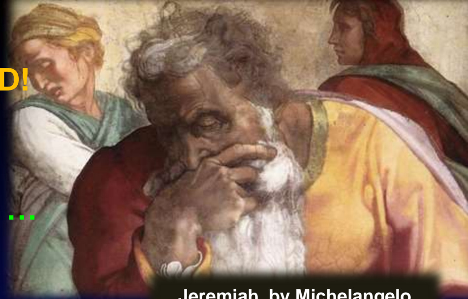
Jeremiah, by Michelangelo Ceiling of Sistine Chapel, Rome

Understands our weakness ... tolerates to a POINT