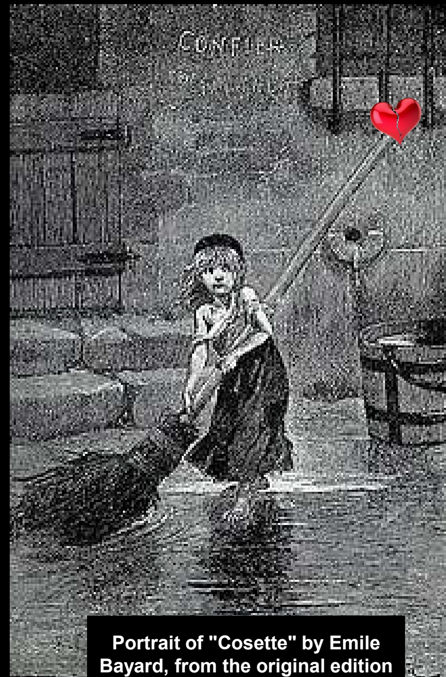
Portrait of "Cosette" by Emile Bayard, from the original edition of Les Misérables (1862)

2012 Musical Les Misérables ... Anne Hathaway rocks as Fantine Fantine CANNOT support Little Cosette WITHOUT this job Fantine only has enough for ONE WEEK's bread