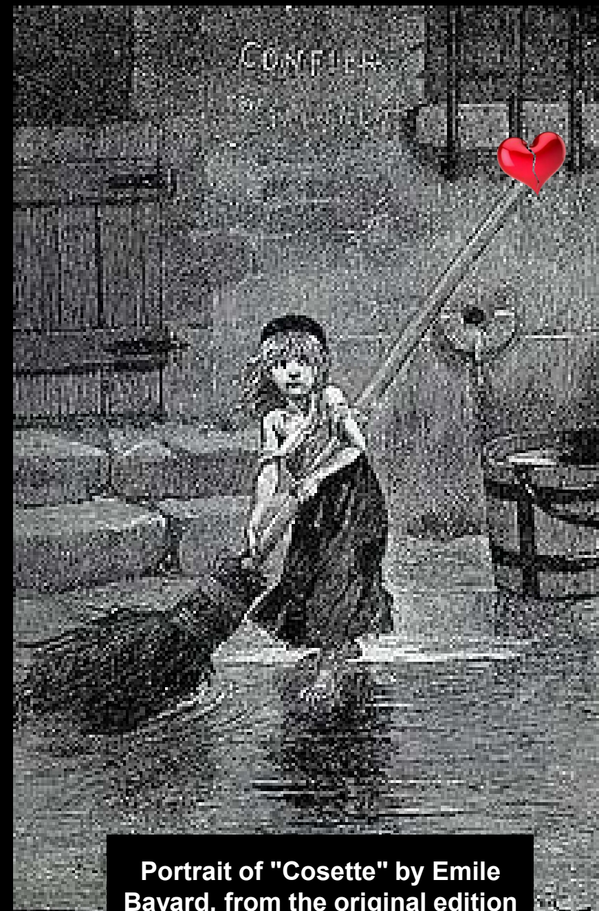
Portrait of "Cosette" by Emile Bayard, from the original edition of Les Misérables (1862)