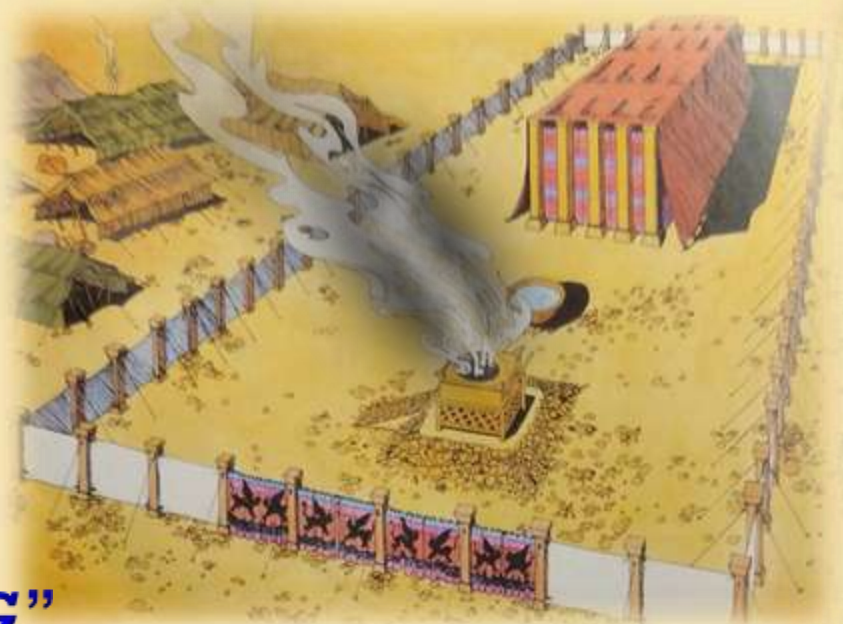
Tabernacle of God in the Wilderness

Cannot define GLORY yet know it when we FEEL AWE