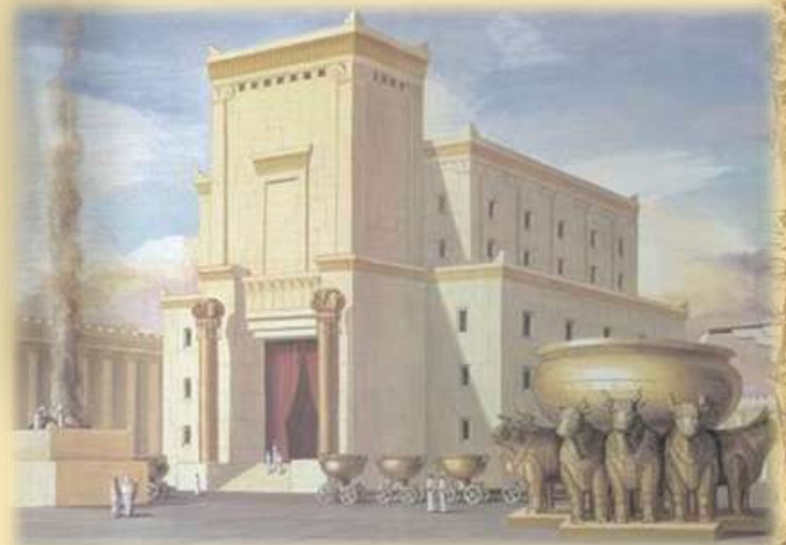
King Solomon's Temple

11 the priests could not perform their service because of the cloud, for the