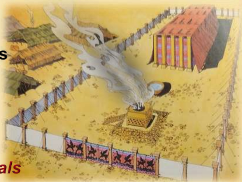
Tabernacle of God in the Wilderness

Daniel 3 King Nebuchadnezzar II saw FOUR in the Fire