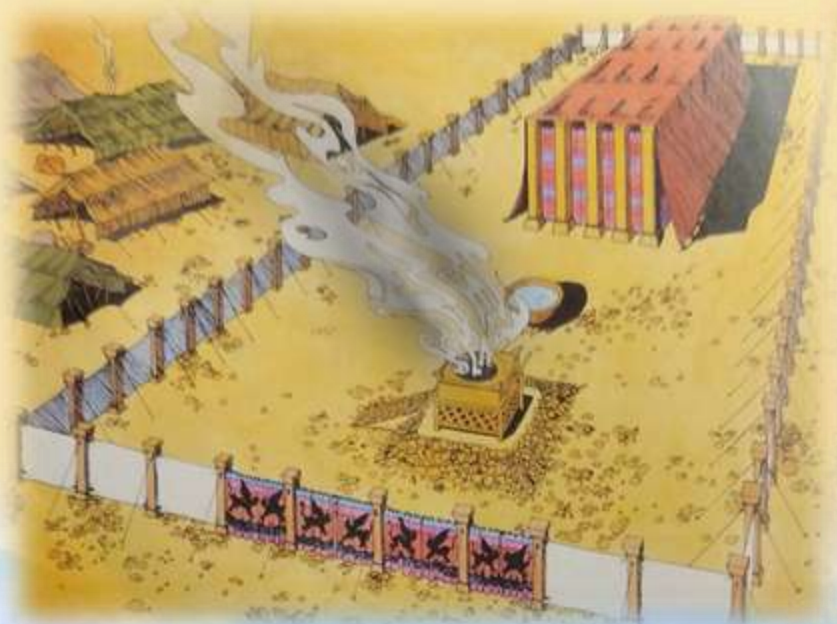
Tabernacle of God in the Wilderness

GLORY of the LORD filled the tabernacle. Divine Presence