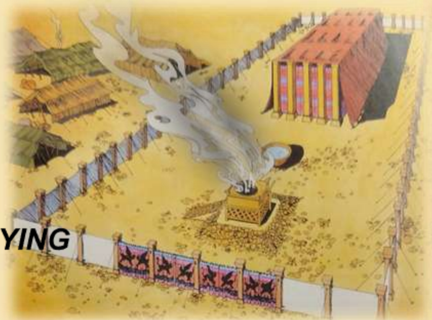
Tabernacle of God in the Wilderness