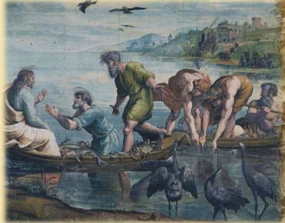
Jesus and Miraculous Draft of Fishes, Raphael, commissioned 1515 by Pope Leo X for the Sistine Chapel

Guard the good deposit that was entrusted to you—guard it with the help of the HOLY SPIRIT who lives in us.