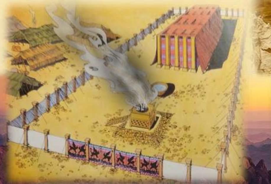
Tabernacle of God in the Wilderness