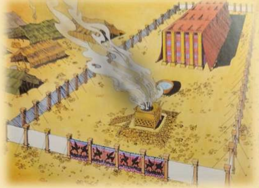
Tabernacle of God in the Wilderness

Hangs curtains ... finishes Tabernacle ... t h e n