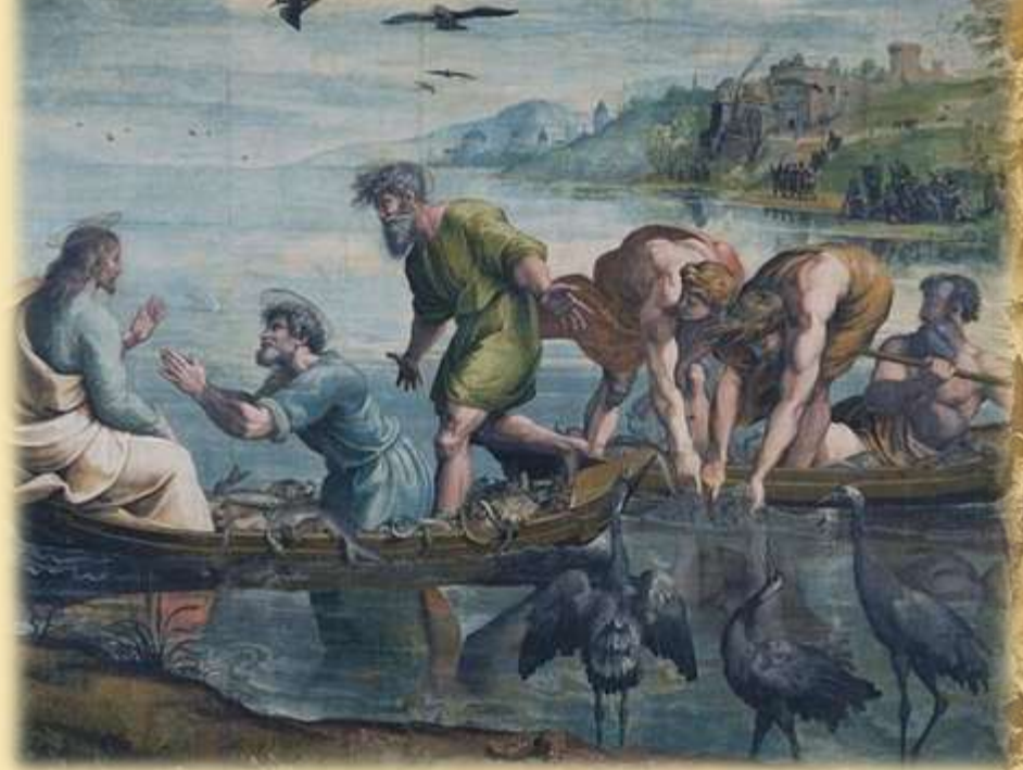
Jesus and Miraculous Draft of Fishes, Raphael, commissioned 1515 by Pope Leo X for the Sistine Chapel

John 17:22, I have given them the GLORY that you gave ME, that they may be one as we are one.