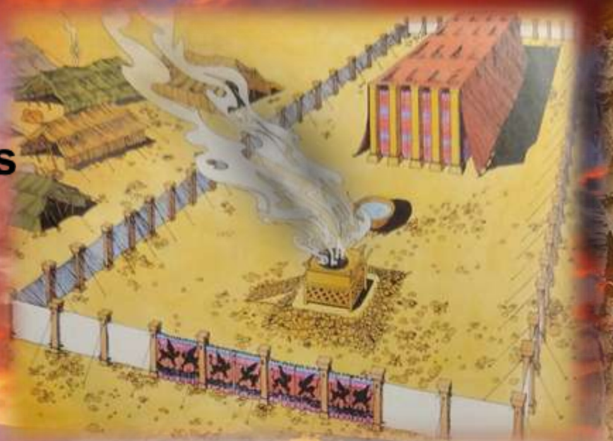
Tabernacle of God in the Wilderness