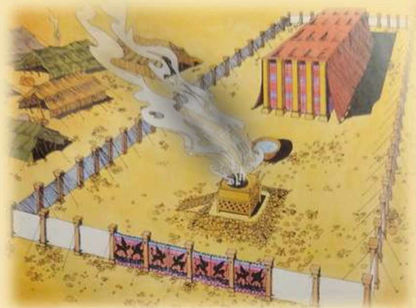
Tabernacle of God in the Wilderness

A similarly spectacular “coming” was when Solomon finished the Temple