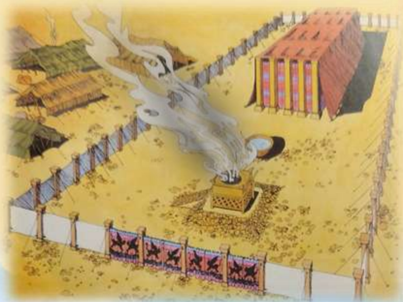
Tabernacle of God in the Wilderness