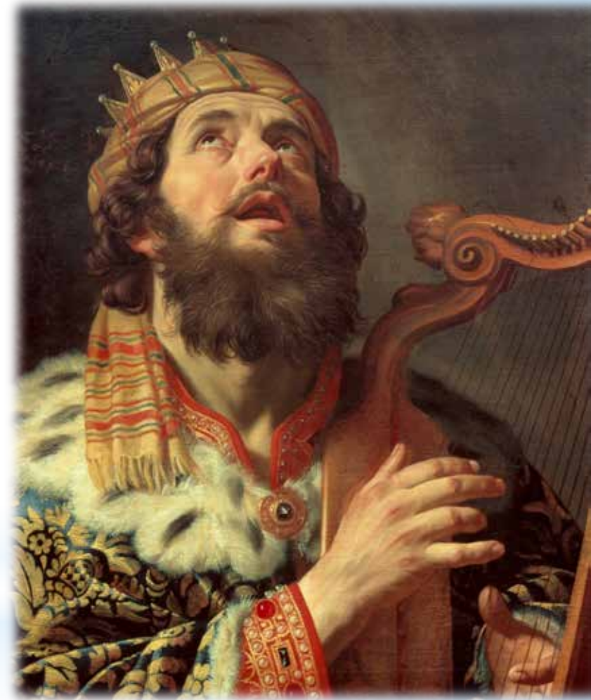
King David Playing the Harp by Gerard van Honthorst, 1622

Surely your goodness and mercy shall follow me all the days of my life, and I will dwell in the House of the LORD forever.