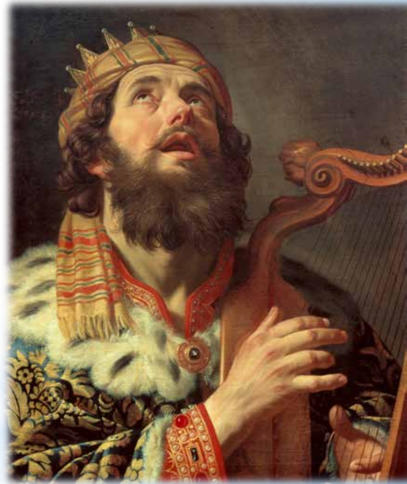
King David Playing the Harp by Gerard van Honthorst, 1622