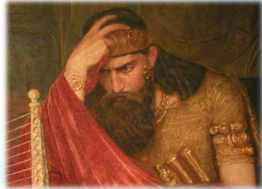
David and Saul by Ernst Josephson, 1878

15 But if you do not obey the LORD, and if you rebel against his commands, his hand will be against you, as it was against your ancestors.