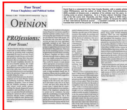
^ click to see full picture ^