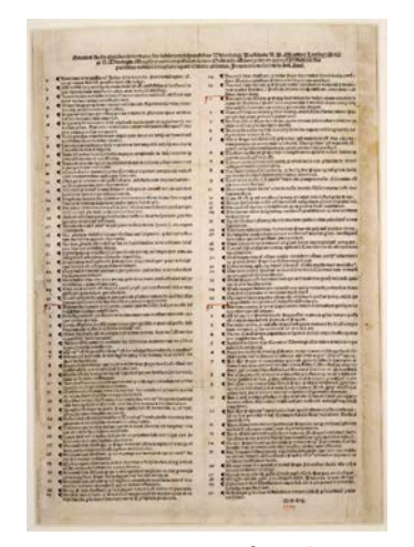
Copy 1517 Ninety-five Theses in the Berlin State Library