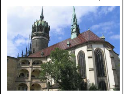
Luther's theses engraved into the door of All Saints' Church, Wittenberg, Germany