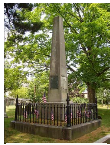
Patriots' Grave, Old Burying Ground, Arlington, Mass.