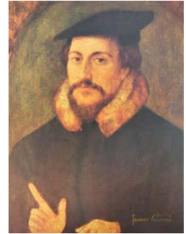
John Calvin Geneva, Switzerland

A host of conferences are being around the world, especially in Geneva, but also in the Orlando, Florida; Decatur, Georgia; Taylors, South Carolina; Princeton, New Jersey; Grand Rapids, Michigan; Toronto and Montreal, Canada; Mainz, Germany, Tokyo, Japan; Edinburgh, England; Stellenbosch, South Africa; Belfast, Northern Ireland; St. Petersburg, Russia; Amsterdam; and The Netherlands.